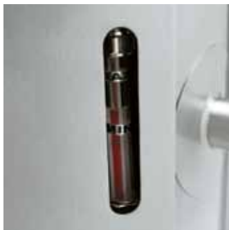
Water level gauge

NOTE: NEB or NGB boiler is available to supply steam to direct steam kettles up to 40 gallon capacity.