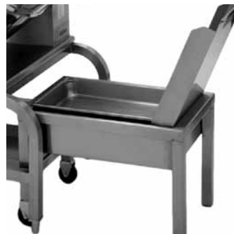
Optional drain cart