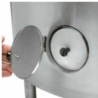
Burner flame view access

Typically used when casters are ordered for stand-mounted table top gas kettles, the optional quick disconnect facilitates cleaning behind equipment. Provided with CSA Design Certified restraining cable and attachments.