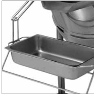
Kettle pan carrier

This simple pan support attaches easily to the front of the kettle and holds a standard steamer pan at the pouring lip for easy filling. The steamer pan stays level regardless of the kettle pouring angle, and is easily removed for cleaning or storage. The pan carrier will hold 2/12-6" deep and half-size (12x10") pans.