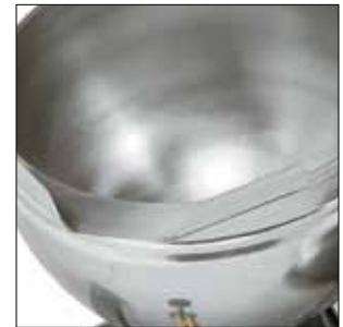
Kettle pouring lip

Strainers are available for the pouring lip of tilt model kettles to strain ingredients past vegetables or seafood. They are easily attached and removed for cleaning and to allow full flow of product when not required.