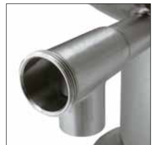
Draw-off valve for easy food transfer (shown disassembled)

Draw-off valves make transfer of thick and chunky product, draining off cooking water and kettle cleaning easier. They are standard on stationary floor models and are available for all tilting floor model kettles to provide additional product transfer options.