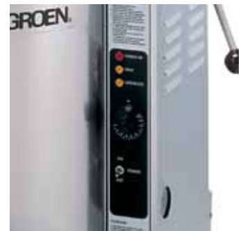
Easy to use control panel