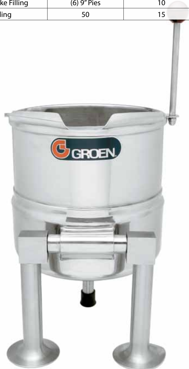
TDC/3-20 Model Shown