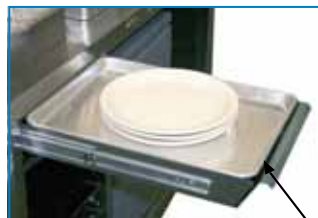
MobilServ® is a registered trademark of Cadco, Ltd.

Cart is open at back for easy access to drawers, shelves, and optional Cambro® Camcarrier®, Models UPC 400 or UPCH 400